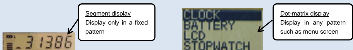
Example of Segment and Dot-matrix LCD display

Generally, the LCD driver on MCU is mainly a segment display that drives several tens to hundreds of dots by 4-8 commons, but the display pattern is fixed and the information that can be displayed on the LCD display is limited. S1C31W73 is equipped with high-resolution dot-matrix LCD driver that can directly drive a maximum 2,560 dots (80 segments x 32 commons), which is the top class onto MCU, and it is possible to add rich expressive display.